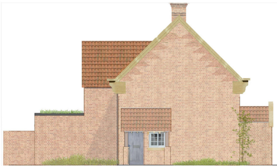
2 Side Elevation 07 1:50