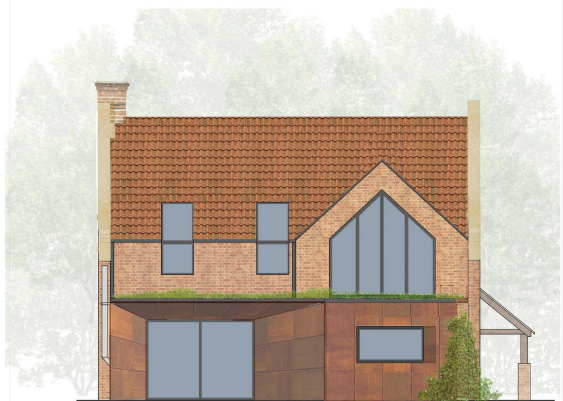
3 Rear Elevation 07 1:50