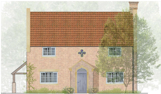
1 Front Elevation 07 1:50