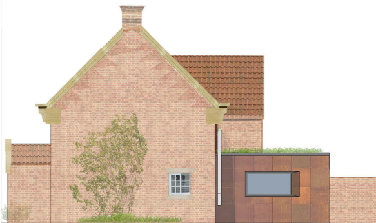
4 Side Elevation 07 1:50

THIS COPY HAS BEEN MADE BY OR WITH THE AUTHORITY OF EVERADY BENTLEY GROUPS PURSUANT TO SECTION 17 OF THE COPYRIGHT PATENTS AND DESIGN ACT 1988. UNLESS THAT ACT PROVIDES A RELEVANT EXEMPTION OR OTHERWISE, THIS COPY SHALL NOT BE LOANED, REPRODUCED OR OTHERWISE USED WITHOUT THE PRIOR PERMISSION OF THE COPYRIGHT OWNER.